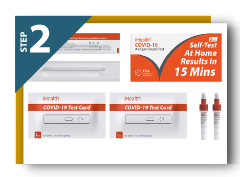
Carefully lay out all sealed contents of your test kit, which includes: 2 swabs, 2 test tubes (solution distribution varies by kit) and 2 test cards.