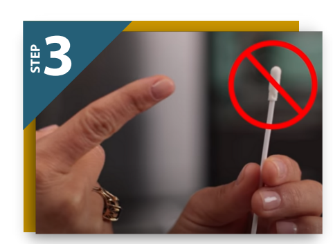
Remove the test card and swab from the packaging. Place your card upright and be sure to avoid contaminating the tip of the test swab.