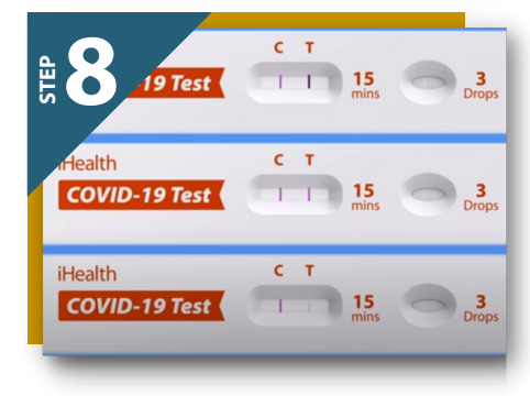
The "T" is the Test line and will only appear if you test positive for the virus. Any line under the "T" is an indication of a positive test result. If there is no line, then you have tested negative.