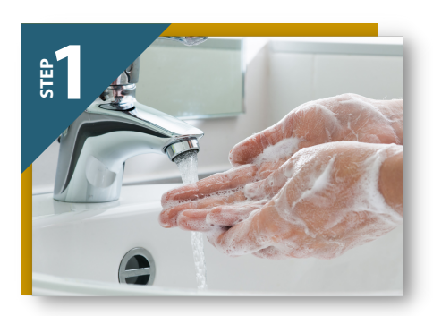
Thoroughly clean a surface for use as a testing area and wash your hands with soap and water.